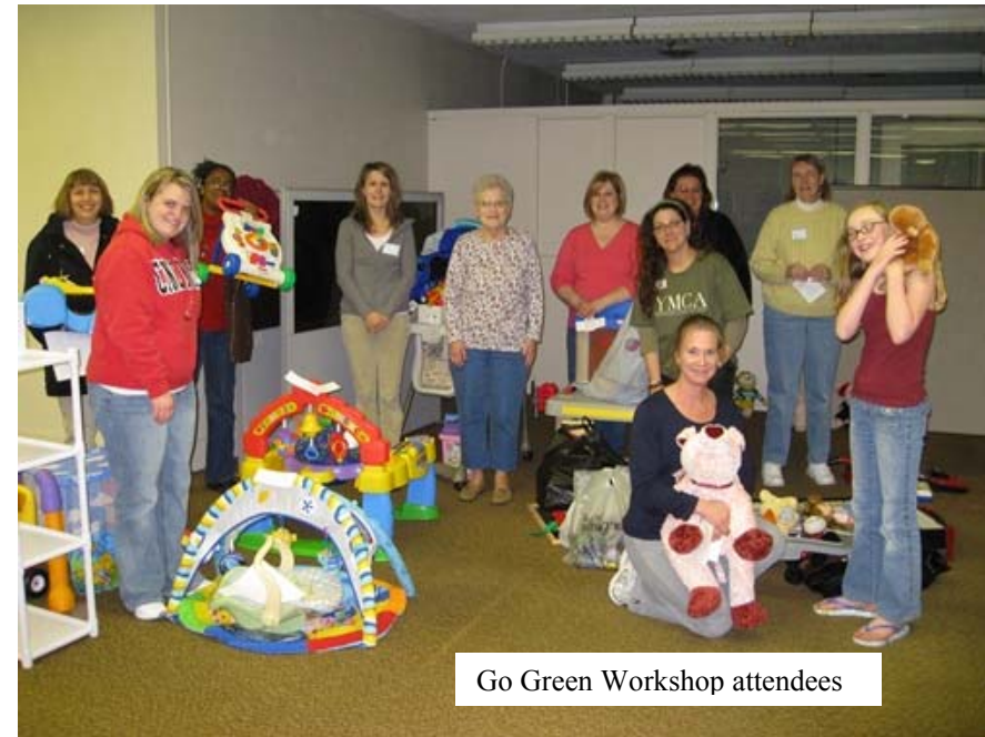
Go Green Workshop attendees

Child Care Choices believes that well-trained child care providers offer better quality child care and encourages all registered providers to attend as many of the Child Care Choices workshops as possible.