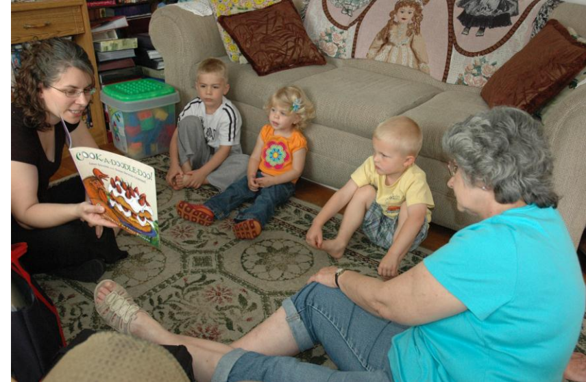
The "Story Lady" reading to children in the home of a child care provider

Child Care Choices believes that well-trained child care providers offer better quality child care and encourages all registered providers to attend as many of the Child Care Choices workshops as possible.