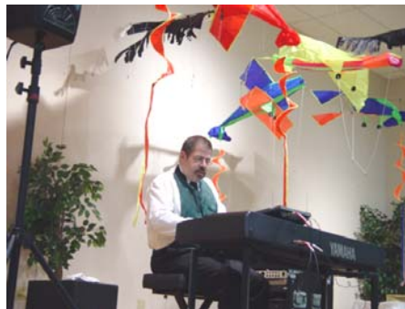
"Flying High with CCC" – 2003 Benefit

Mark your calendar for the annual CCC Benefit/ Auction March 20, 2004 At St. Patrick's Center in Troy