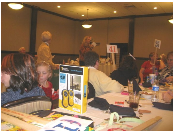
Quarter Auction 2010

To purchase tickets, call Child Care Choices at 937-667-1799.