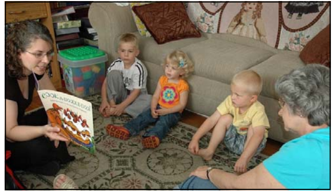
Story Lady Visit

For more information on Step Up To Quality, go to www.stepuptoquality.org or call Child Care Choices 937-667-1799 for assistance on getting started.